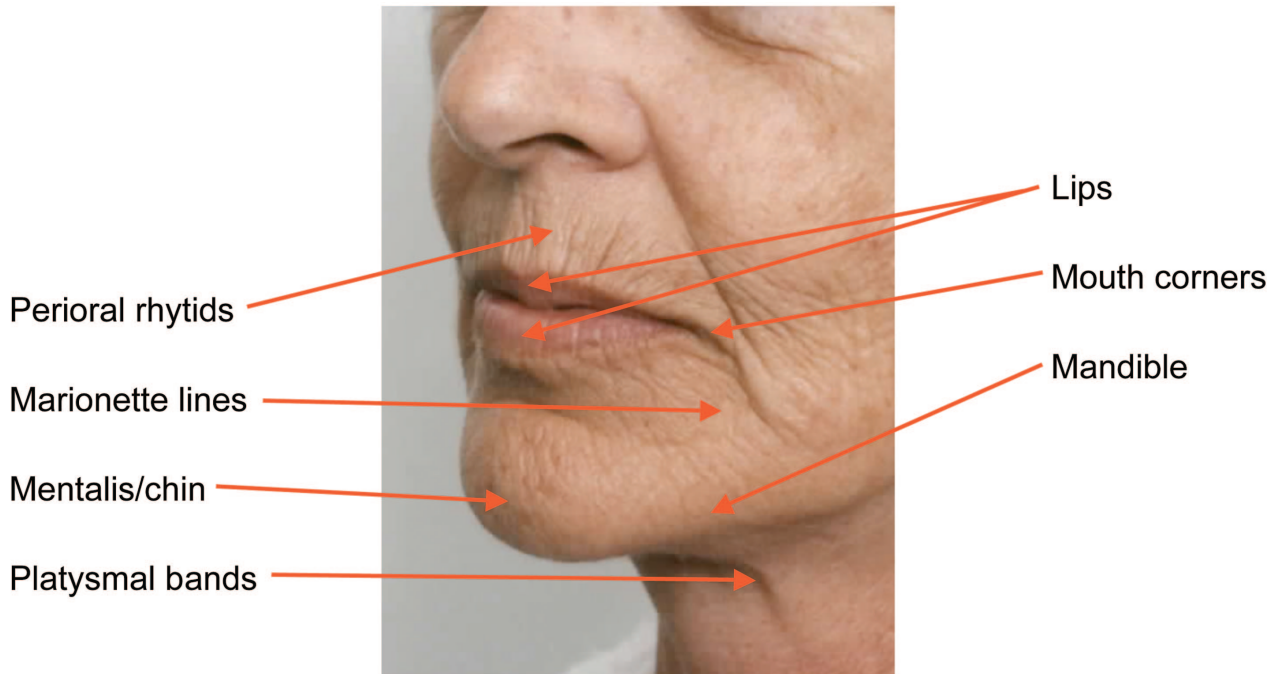
Fig. 3. Changes in the lower face due to aging.

contractions lead to furrows and lines that are superimposed on volume loss and exacerbated by loss of elasticity. Textural changes are also very apparent in the skin of the lower face, which may be amenable to various resurfacing modalities in combination with other treatments.