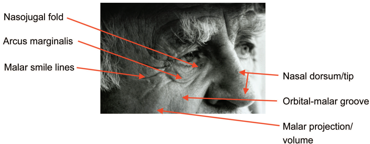
Fig. 1. Changes in the midface due to aging.

with most patients requiring 0.2 to 0.3 ml. The deepest portion of the medial tear trough was treated first, and multiple passes with small amounts of hyaluronic acid filler were used. At the 10-day follow-up, 22 of the patients reported satisfaction with their appearance.